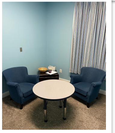
This room is a safe place.