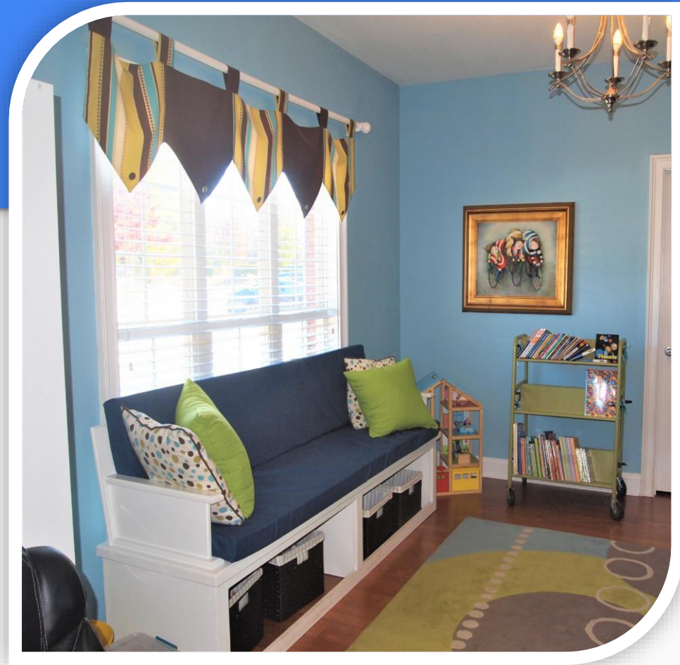
The waiting area is a safe place.